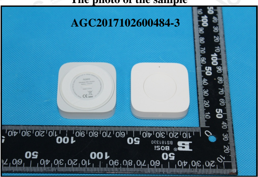
AGC authenticate the photo on original report only *** End of Report ***

The results shown in this test report refer only to the sample(s) tested unless otherwise stated and the sample(s) are retained for 30 days only. The document is issued by AGC, this document cannot be reproduced except in full with our prior written permission. The more details and the authenticity of the report will be confirmed at http://www.agc-eatt.com.