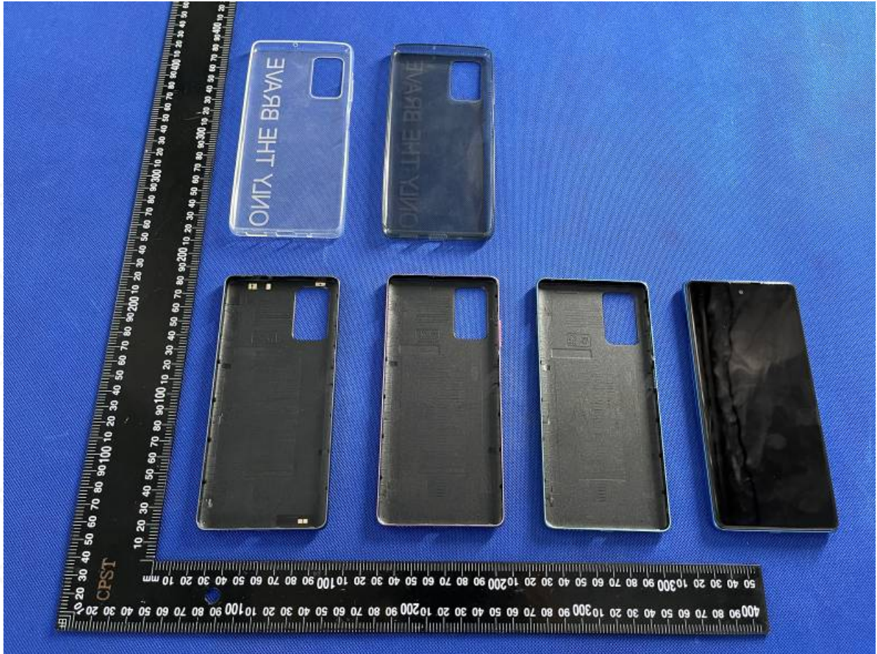
Photo of the Submitted Sample

Note: This Test report shall be invalid if it is not stamped with the special seal for testing. Only responsible for the tested samples, invalid if rewritten, added and deleted. This test report cannot be reproduced, except in full, without prior written permission of the Company. Any unauthorized alteration, forgery or falsification of the content or appearance of this report is unlawful and offenders may be prosecuted to the fullest extent of the law. Any demurral to the content of test report, please propose in 15 days after the report's sending out, it will not be accepted after this date.