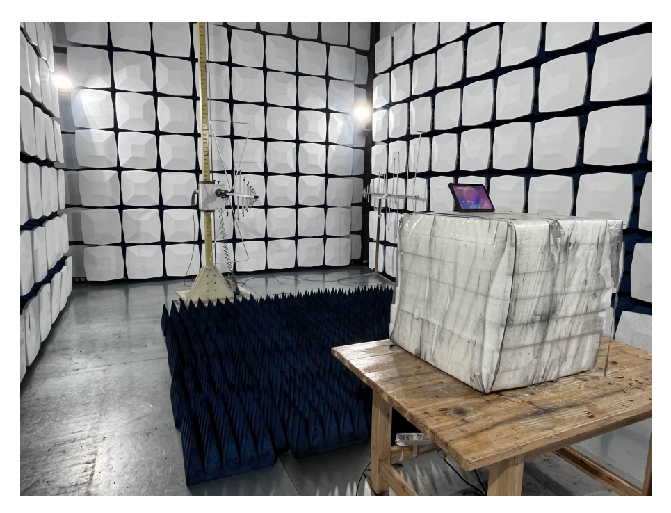
RADIATED EMISSION ABOVE 1G TEST SETUP