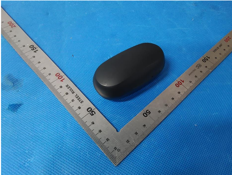
Fig.1 – overview