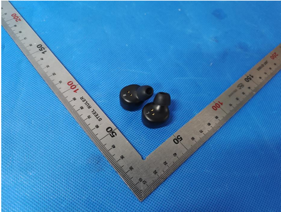
Fig.3 – overview