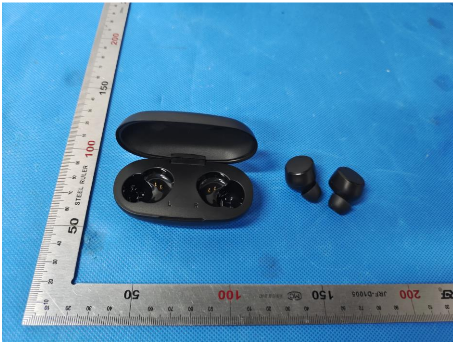
Fig.2 – overview

Any report having not been signed by authorized approver, or having been altered without authorization, or having not been stamped by the “Dedicated Testing/Inspection Stamp” is deemed to be invalid. Copying or excerpting portion of, or altering the content of the report is not permitted without the written authorization of AGC. The test results presented in the report apply only to the tested sample. Any objections to report issued by AGC should be submitted to AGC within 15days after the issuance of the test report. Further enquiry of validity or verification of the test report should be addressed to AGC by agc01@agccert.com .